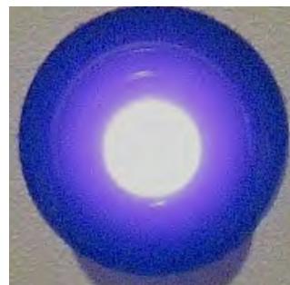
From a patient's perspective the UV light appears to have a soft blue color.

The CXL treatment is an outpatient procedure performed in the doctor's office using only numbing eye drops and a mild sedative like a Valium tablet. You'll need to lie flat on your back in a reclining chair and look up at a soft blue light during the treatment. The epithelium, a thin layer of clear, protective tissue (like skin) that covers the cornea is removed for the CXL procedure. Next, vitamin eye drops (riboflavin) are used in the eye and you will be asked to look at a special blue (ultraviolet) light while lying comfortably on a reclining chair. It's generally easy to look at this light because your eyes are numb and we use drops so your eyes won't feel dry.